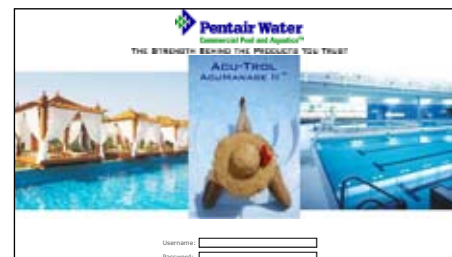
AcuCom™ Software and AcuManage II™