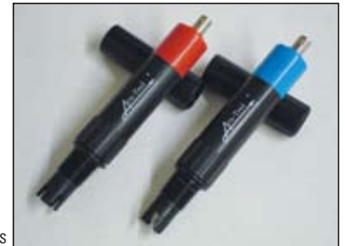
pH and ORP Sensors